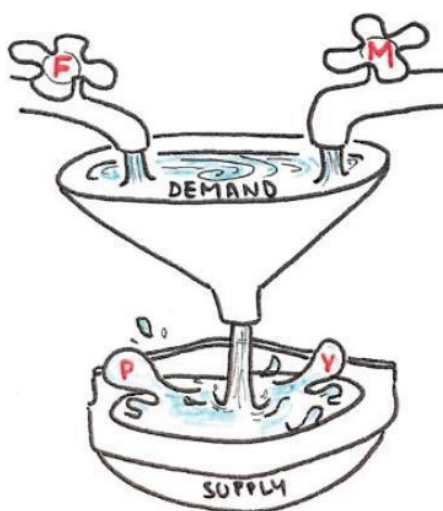
Chart 1: James Tobin's funnel

Note: F stands for fiscal policy; M for monetary policy; Y for economic activity; and P for the general price level.